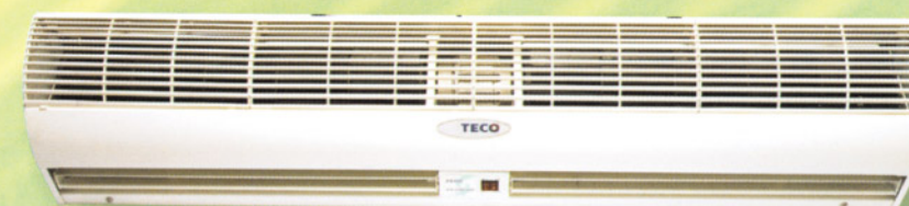
PNN-K4 series Width : 120cm