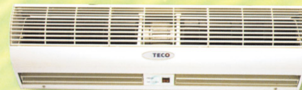
PNN-K3 series Width : 90cm